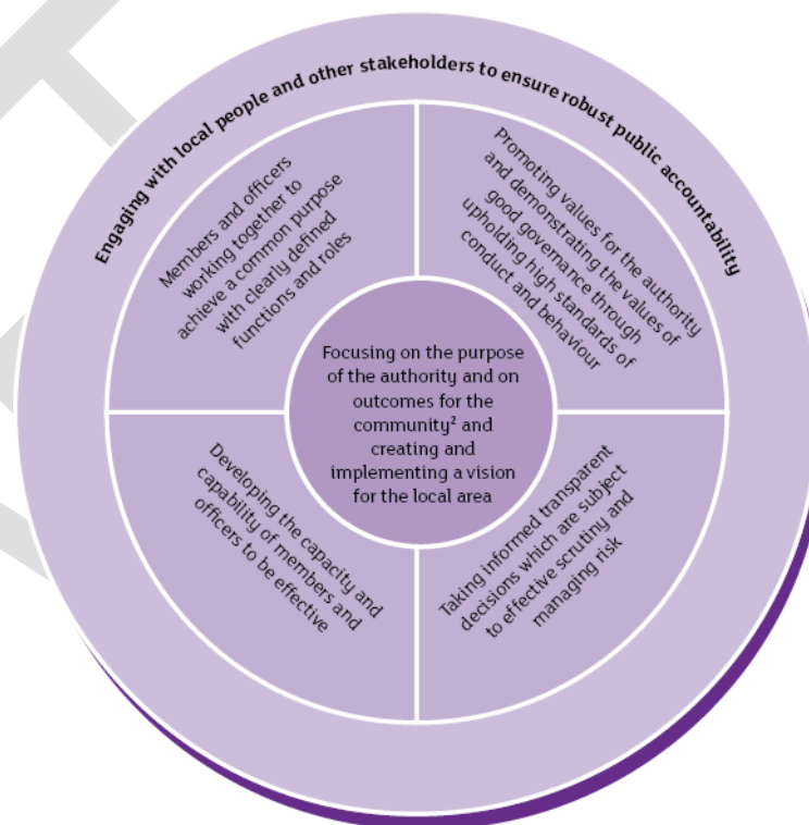
Figure 1: Summary of the CIPFA/SOLACE Framework Principles